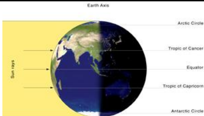
Illumination of Earth by the Sun at the equinox